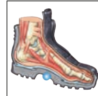
HAIX® AS System